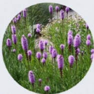
marsh blazing star

Plant your rain garden with native perennial plants with deep root systems. Native plants that can handle variable amounts of moisture will do best. After a rain, your garden will be full of water, but in drier weather, it won't have much moisture.