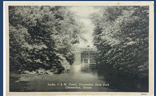
Locks, I. & M. Canal, Channahon State Park, Channahon, Illinois

Take a peek at these historic postcards of Channahon State Park! While the exact date of these postcards is unknown, they used to be available for purchase at Petrusa's Grocery Store, which opened in Channahon in 1947.