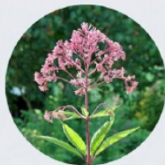
joe pye weed