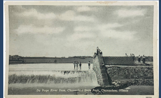
Du Page River Dam, Channahon State Park, Channahon, Illinois