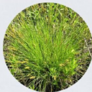
native rushes and sedges